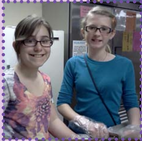
Pictured are Children's Ministries 6th Graders, who recently volunteered to help make and serve dinner to our PADS guests on January 22. Thank you!