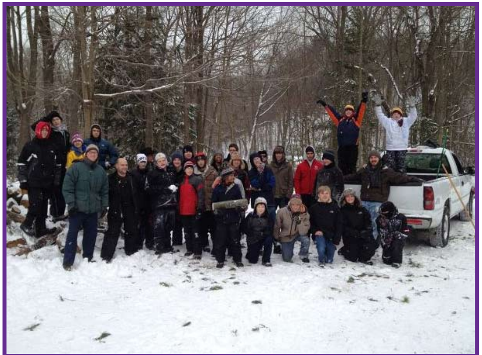
Thirty-three of our Youth Ministries Guys headed to a snowy Tower Hill in January for a weekend of tree chopping, fellowship and male bonding!

SOUPER BOWL OF CARING † February 5, 2012